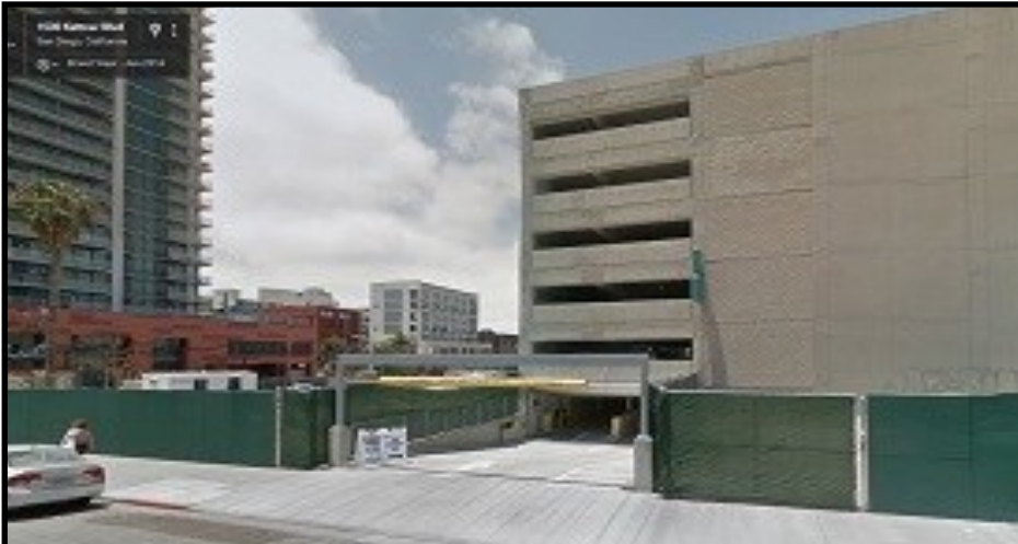
Little Italy Parking Garage 715 W. Cedar St Public Parking enter on Kettner $10 per vehicle Open 6am-midnight