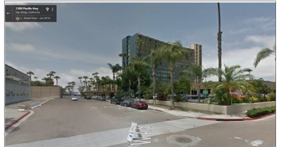
Wyndham San Diego Bayside 1355 N. Harbor Dr. Public Parking enter on Pacific Highway $5 per hour / $35 max