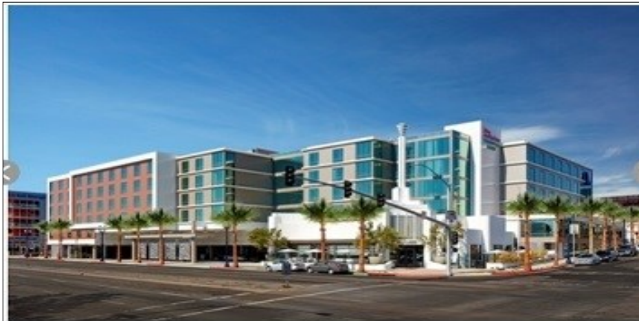
Hilton Garden Inn 2137 Pacific Highway Valet parking enter on Pacific Highway $15 per vehicle